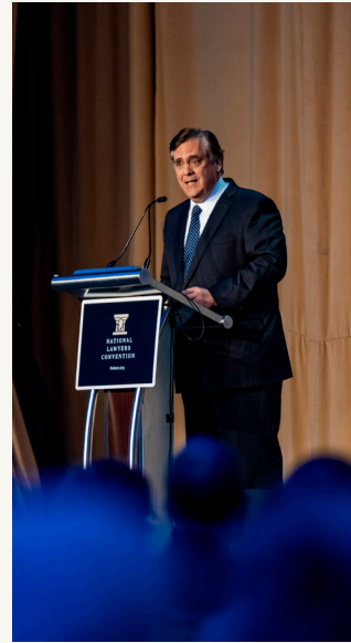
Prof. Jonathan Turley offers the annual Barbara K. Olson Memorial Lecture at the 2024 National Lawyers Convention in Washington, D.C.