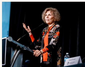
Prof. Nadine Strossen emphasizes the importance of free speech in higher education at the 2024 National Lawyers Convention in Washington, D.C.