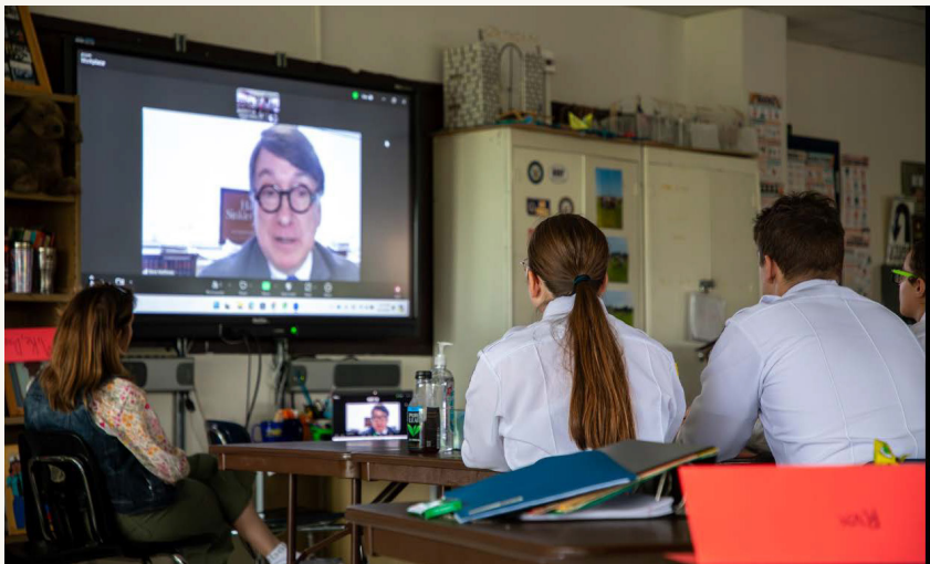
Students observe a virtual lecture on the Constitution.