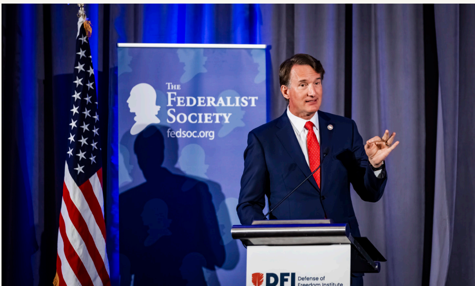
Governor Glenn Youngkin addresses the 2024 Education Law & Policy Conference at the Mayflower Hotel in Washington, D.C.

Throughout 2024, the Practice Groups hosted more than 150 virtual events. The top ten webinars alone garnered a combined total of 107,166 views. Our webinars routinely attract hundreds of live viewers, who can interact with featured speakers through live Q&A. Recordings of these events are then posted to YouTube and our podcast page where they receive thousands more views and listens, enabling new levels of engagement with a diverse audience of experts, lawyers, and the general public. Our Supreme Court programming has continued to enjoy immense popularity with our audience. Our Supreme Court preview series, A Seat at the Sitting, consistently attracts large viewership. Our Courthouse Steps series, which features discussions of individual oral arguments and decisions just after they occur, also continues to perform exceptionally well. Our Litigation Update series featuring programming on non-Supreme Court cases has also been very popular, and it provides expert commentary on important cases that may not have much coverage elsewhere.