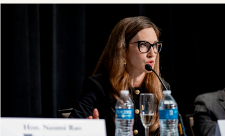
Judge Kathryn Kimball Mizelle explores the future of administrative law at the 2024 National Lawyers Convention in Washington, D.C.