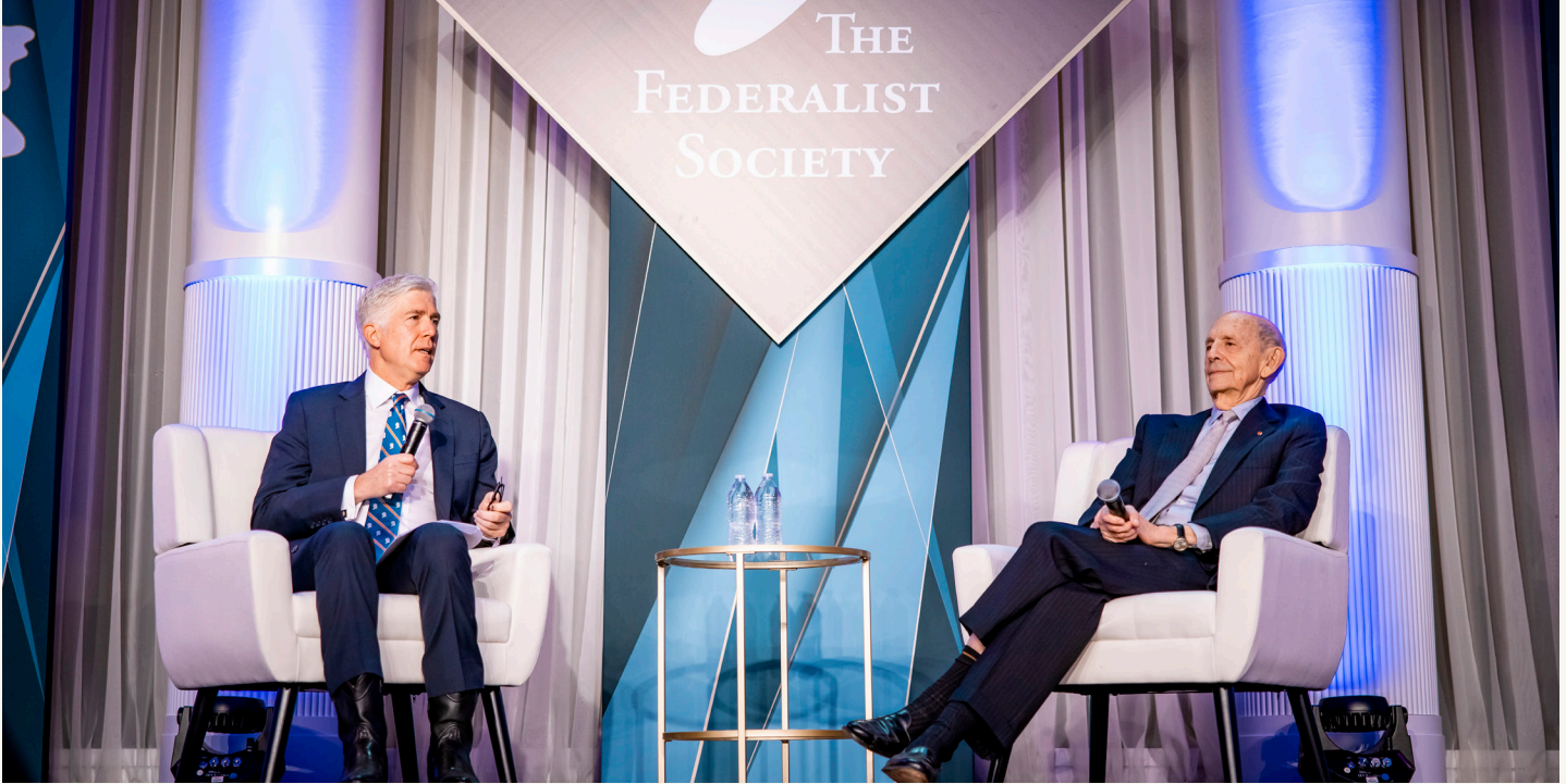
Justices Neil Gorsuch and Stephen Breyer hold a fireside chat at the 2024 Antonin Scalia Memorial Dinner at the Washington Hilton in Washington, D.C.