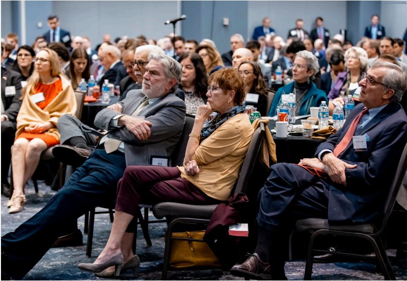
Attendees listen to a panel at the 2024 National Lawyers Convention in Washington, D.C.