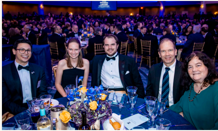
Attendees enjoy the 2024 Antonin Scalia Memorial Dinner at the Washington Hilton in Washington, D.C.