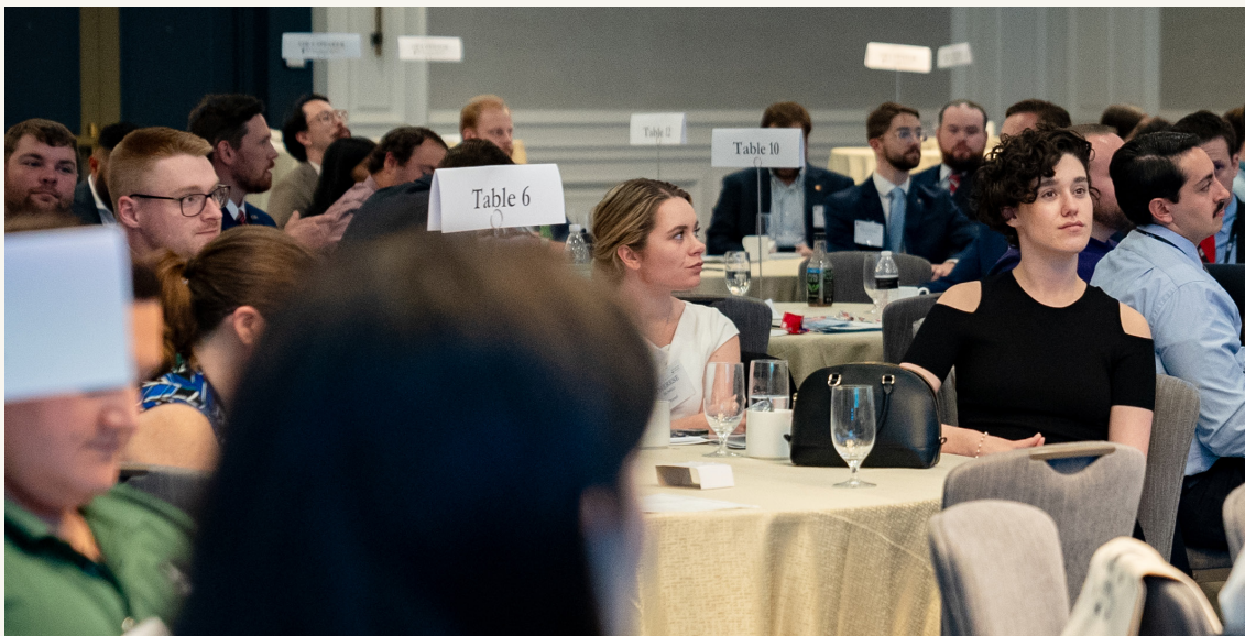
Student chapter presidents listen to a speaker at the annual Student Leadership Conference.

The Student Division also hosted the annual Student Symposium, which is held on a different law school campus each year. The 2024 Symposium, held at Harvard Law School, centered around the question: “Why Separate Powers?”. Attendees enjoyed the Symposium’s debates and panels, which featured professors, judges, and legal scholars. Students welcomed this opportunity to socialize with hundreds of like-minded peers.